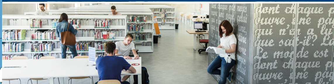
FRANCE - UNIVERSITÉ SAVOIE MONT BLANC