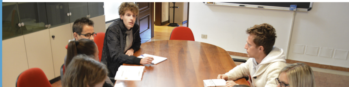
ITALY - UNIVERSITÀ DI TRENTO